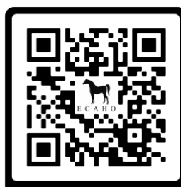
Rules for Sportclasses