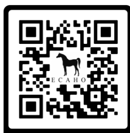
Rules for Conduct of Shows

Only ECAHO approved QR codes are allowed as they guarantee the latest version of the regulations and usage statistics. These QR codes can be downloaded from the ECAHO website.